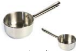
large and small saucepan

glasses, plates, bowls and cutlery to serve your food