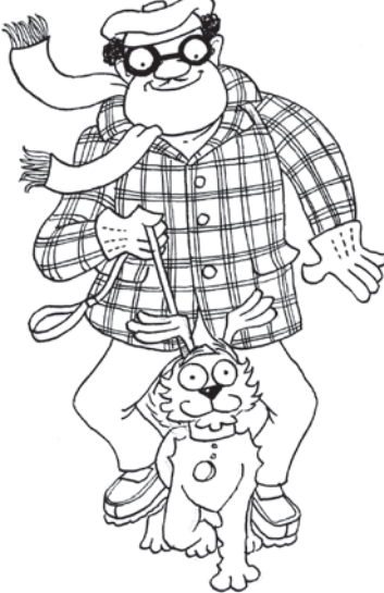
Professor Foodsmart and Snack

Colour the pictures then fill in the missing letters to say what everyone's sport is.